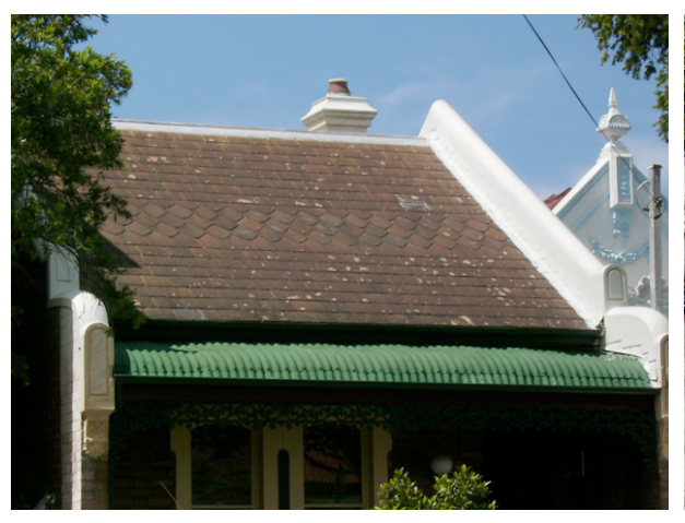
Figure 7.15. This original slate roof is finely textured and adds to the aesthetic value of the Area