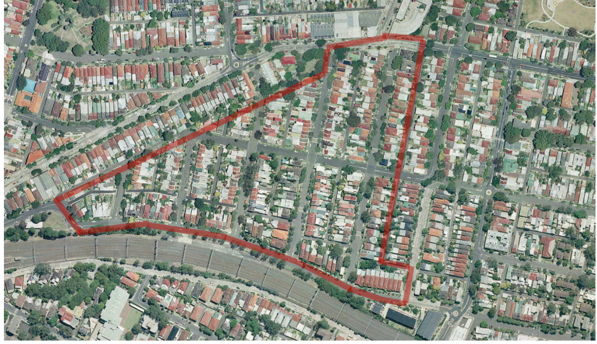
Figure 7.2 The Area in 1943 and 2009 (source: NSW Lands Department SIX Viewer)