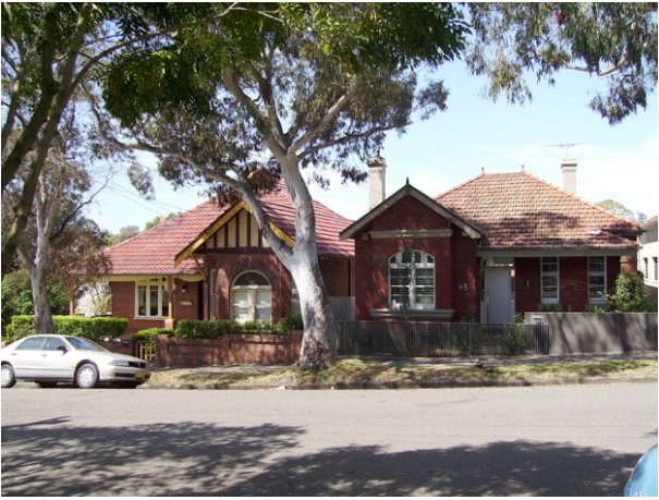
Figure 7.9. This group of modest Federation terraces facing Railway Parade is substantially intact and continues to demonstrate many of the finer details of Federation cottage design which is often lost through subsequent redevelopment. These include tradesmen's gates as well as the pedestrian gate, lattice screens to side passages and fine detailing to the façade.