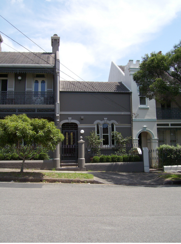
Figure 7.11 and 7.12. The area also demonstrates some contemporary solutions to alterations and additions. These range from the original to the traditional in approach.