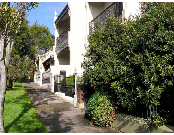
Figure 7.16 the footpath is separated from the road by a grass verge planted with mainly native street trees.