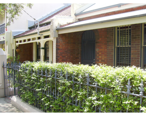
Figure 7.14. Detail of the facade of modest Federation era terraces demonstrating duochrome brickwork. Simple security bars painted a dark colour help to minimise their visual impact on the streetscape.