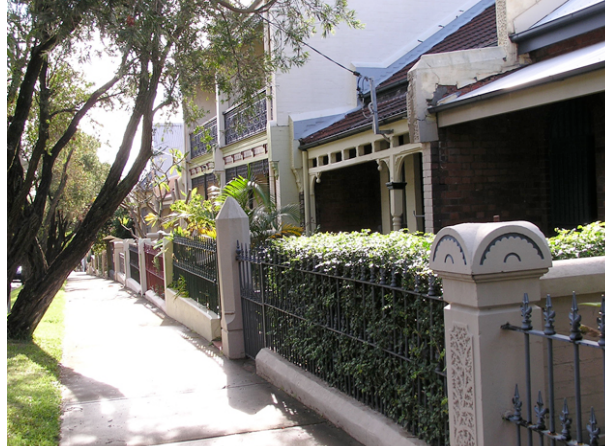
Figure 7.3 and 7.4 The consistent setbacks, fences and terraced built forms have resulted in highly cohesive streetscape throughout the area, including some very good individual examples.