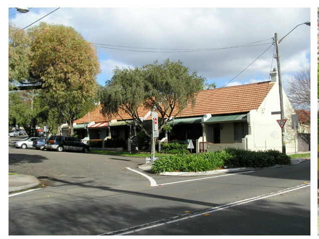
Figure 7.17. The entry to the area from Salisbury Road is marked by this good group of simple terraces under a common roof.