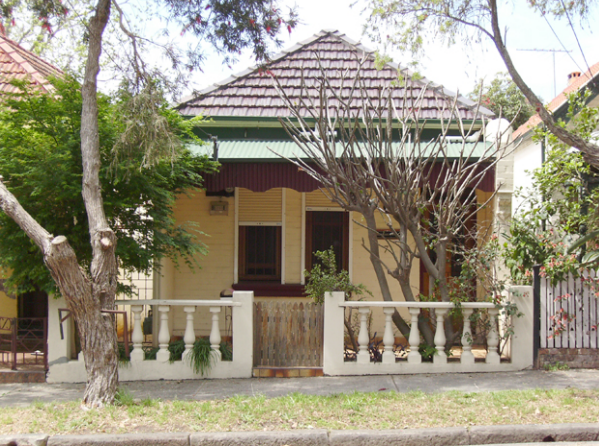
Figure 7.18. Changes such as rendering face brickwork, replacing the iron palisade fence with cement balustrading and the installation of roller shutters changes the aesthetic quality of the original cottages.