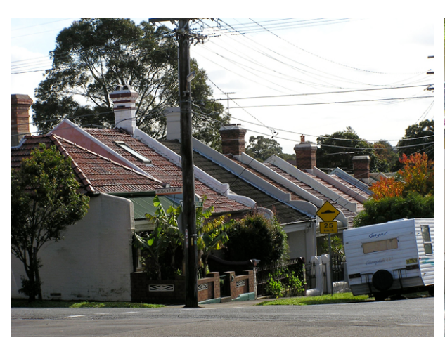
Figure 7.13. Streetscape view. The dividing walls and chimneys are an important element of the roofscape as it steps down the hill towards Salisbury Road.